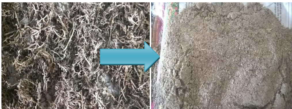
Fig 1. Cladonia rangiferina sample was crushed to powdered form.

Lichen material : C. rangiferina thalli was collected from Sela Pass and was identified based on standard literature (Awasthi, 1988; Swinscow and Krog, 1988). The collected material was washed thoroughly with distilled water followed by tween 80 and made air dried. The dried material was weighed and made into powdered form.